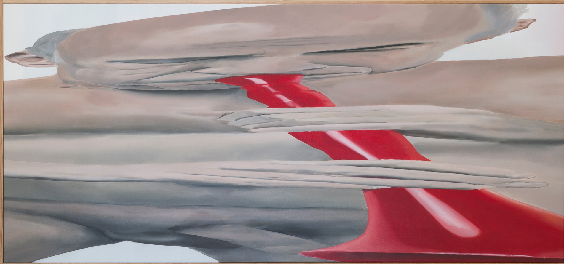
RYAN CULLEN The Fourth Angel of Signification (Kevin) , 2019 oil on canvas, wood frame 240 x 110 cm