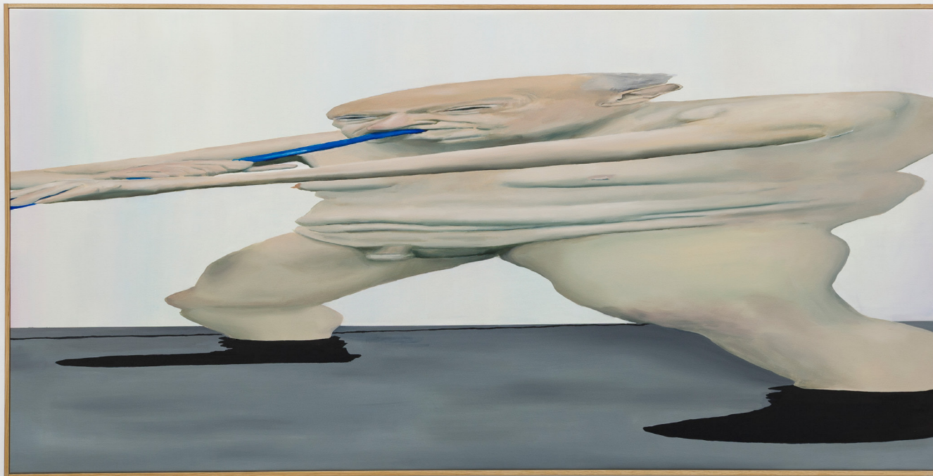
RYAN CULLEN The Third Angel of Signification (Gary) , 2019 oil on canvas, wood frame 240 x 120 cm