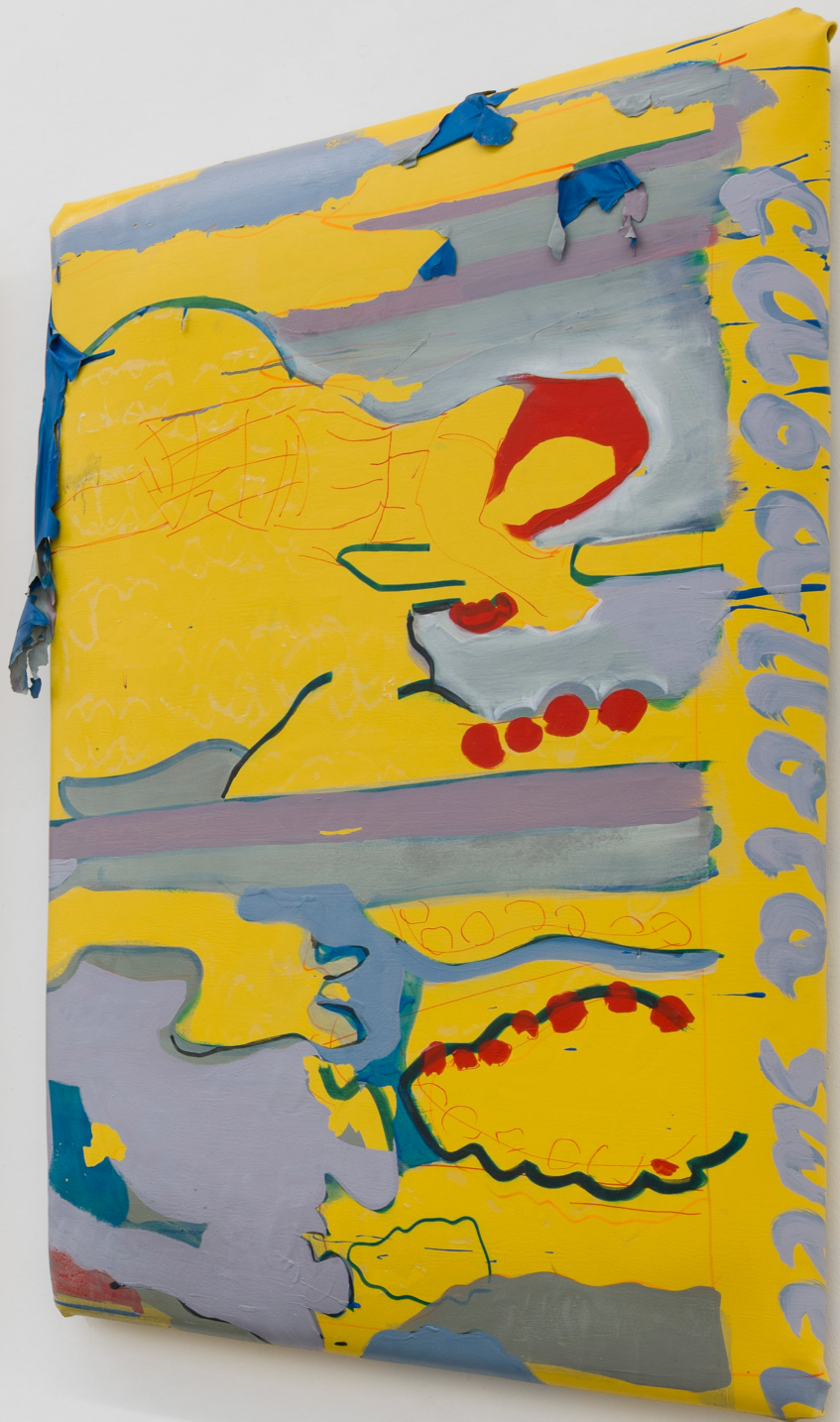
ISABEL ALICIA BAPTISTA En Suite , 2019 synthetic leather , pva glue, acrylic paint, permanent marker 125 x 78 x 8 cm (left work)