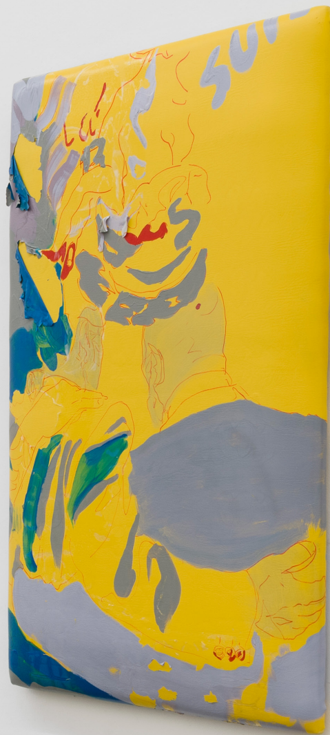
ISABEL ALICIA BAPTISTA Caballota Sweet , 2019 synthetic leather , pva glue, acrylic paint, permanent marker 125 x 78 x 8 cm (right work)