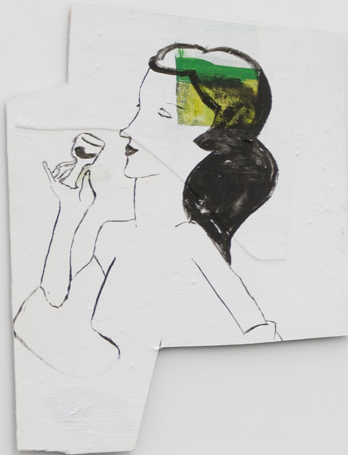
TOM KRÓL Lieber Rotwein als tot sein , 2019 lacquer, acrylic, oil, canvas on wood 64 x 45 x 1 cm