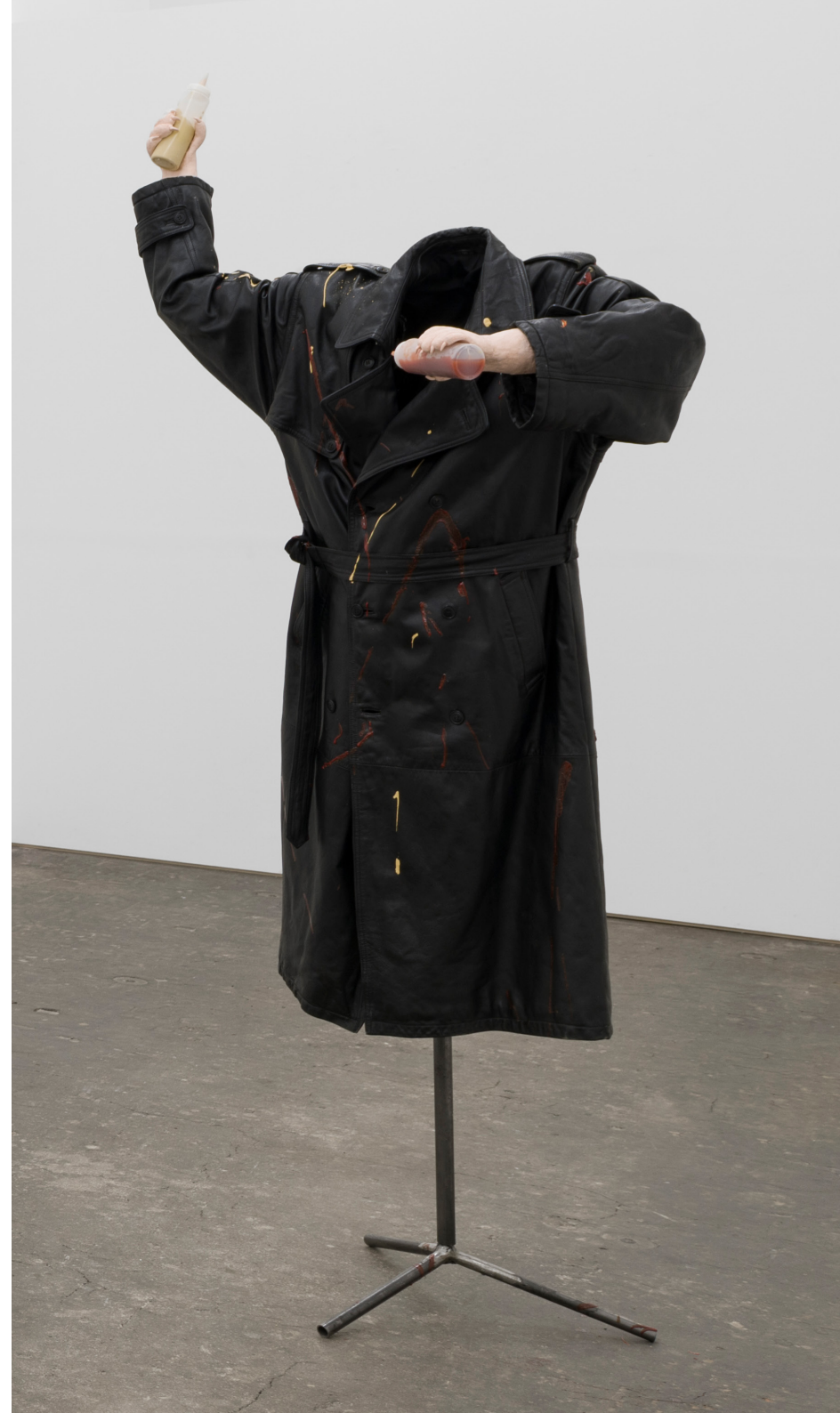
XENIA BOND God, Jesus , 2019 flasher jacket, steel, archival ketchup, archival mustard 197 x 100 x 67 cm