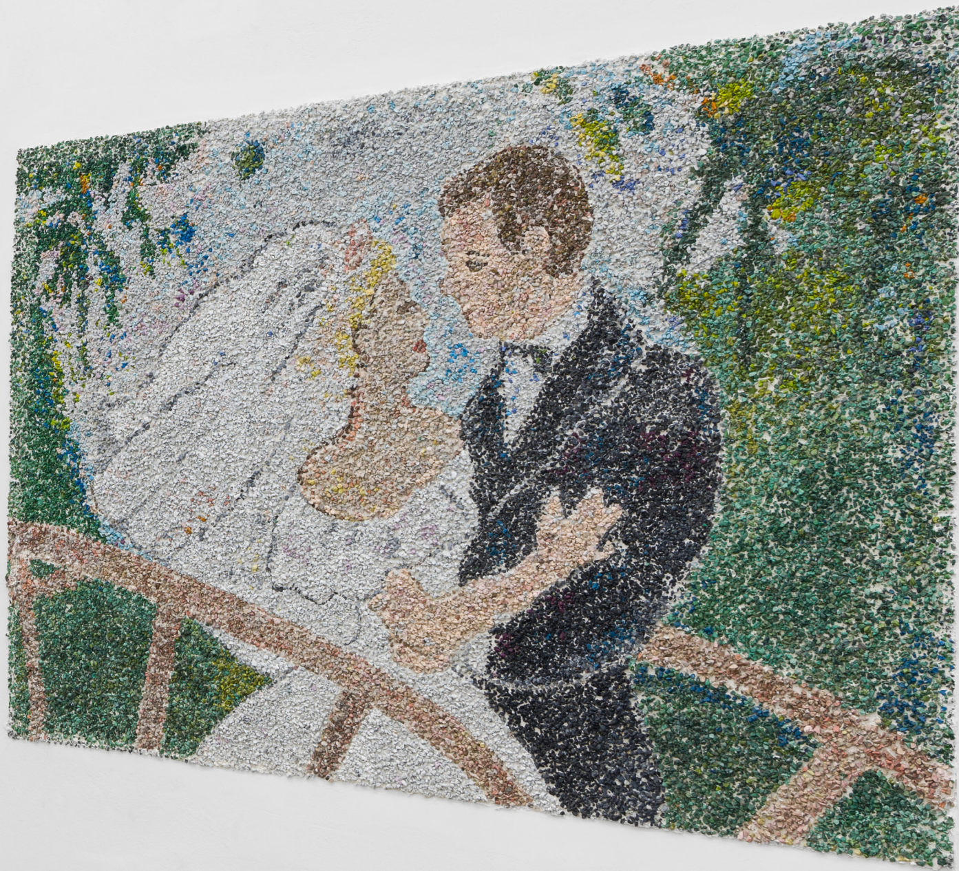
XENIA BOND Scala Lego set 3201, 2019 car park gravel, acrylic and caulk 98 x 146 cm