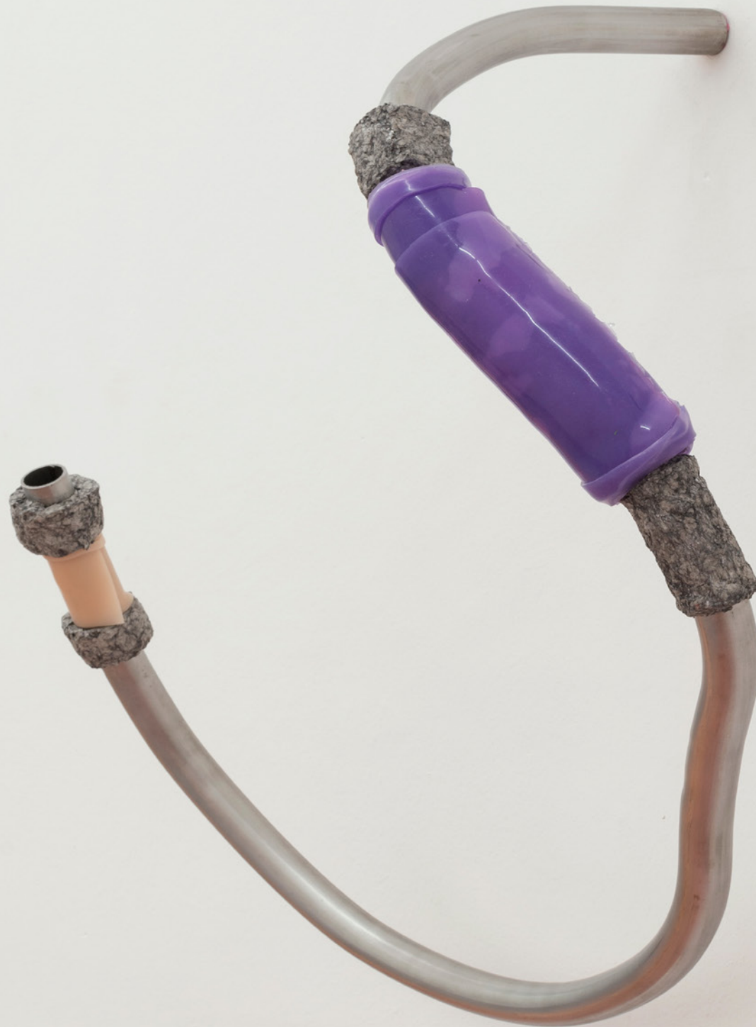
„Geländer III / rail III“ 2017 stelle, rubber, paper mâché 56 x 60 x 25cm