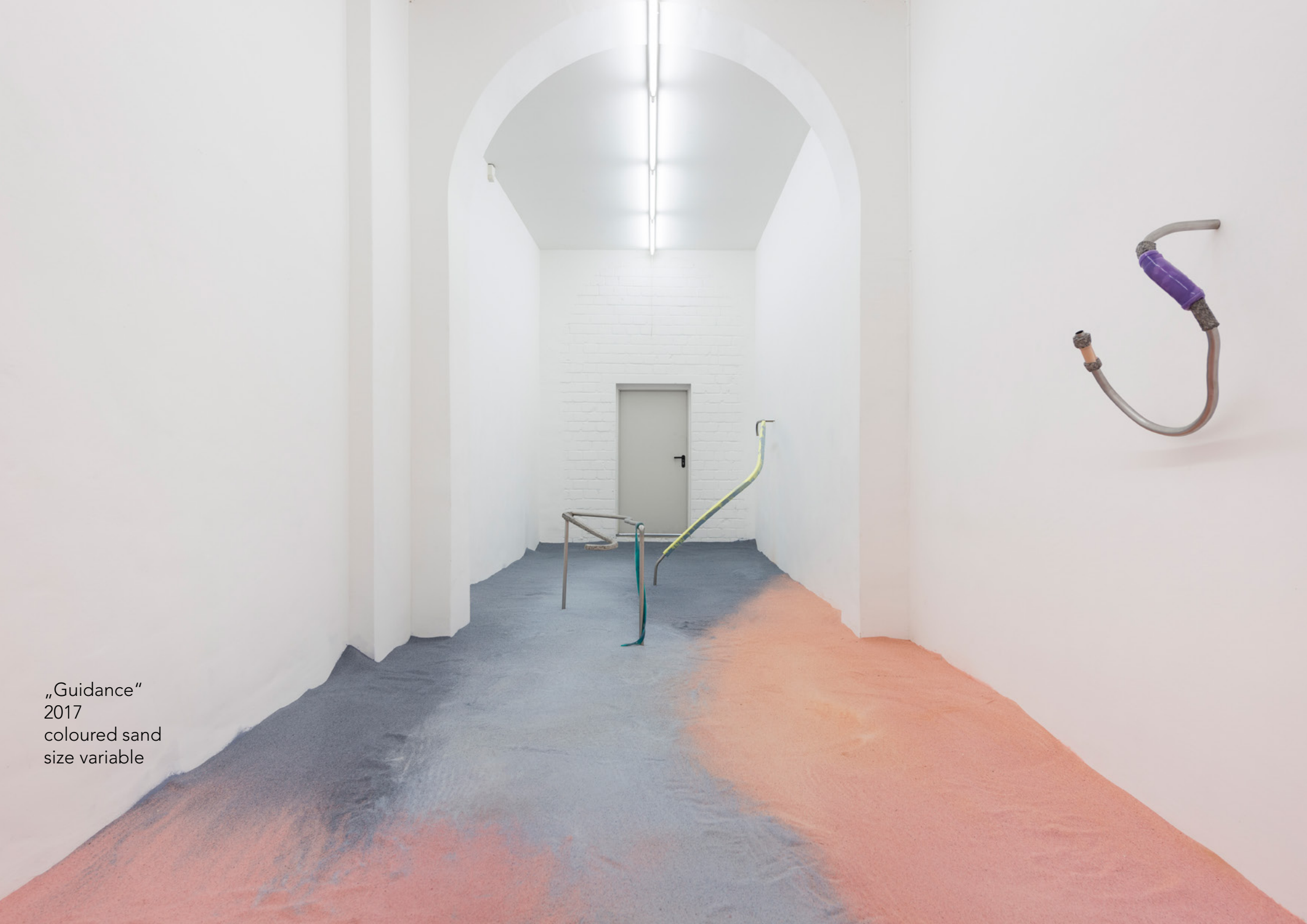
„Guidance“ 2017 coloured sand size variable