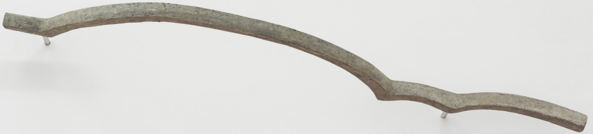
„Welle II / wave II“ 2017 paper mâché 154 x 48 x 35 cm