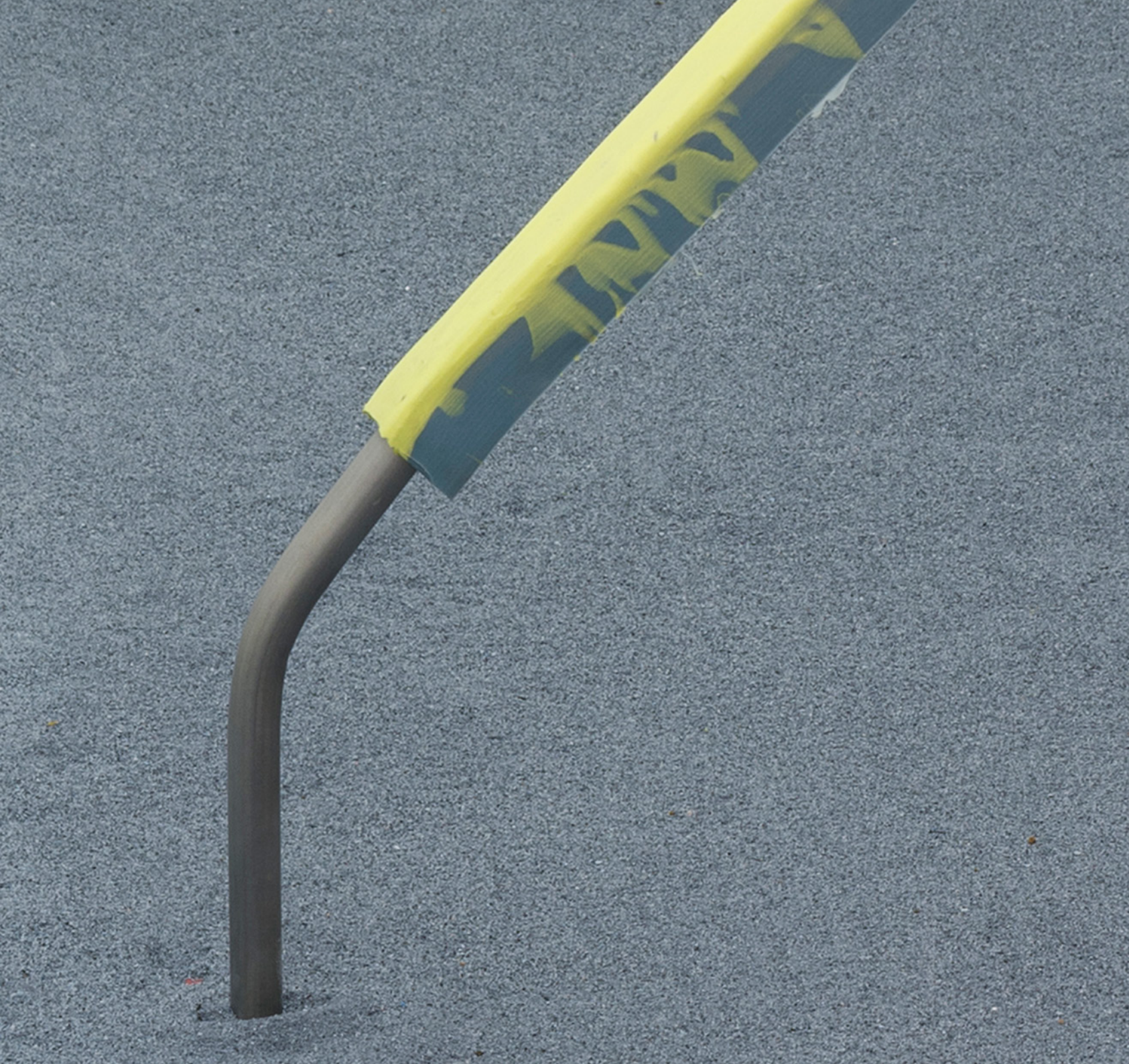
„Geländer I / rail I“ 2017 detail