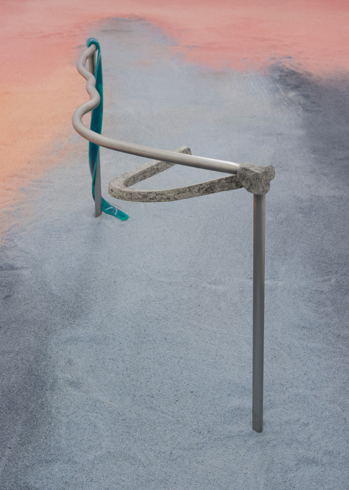
„Geländer II / rail II“ 2017 steel, rubber, paper mâché 145 x 45 x 72 cm