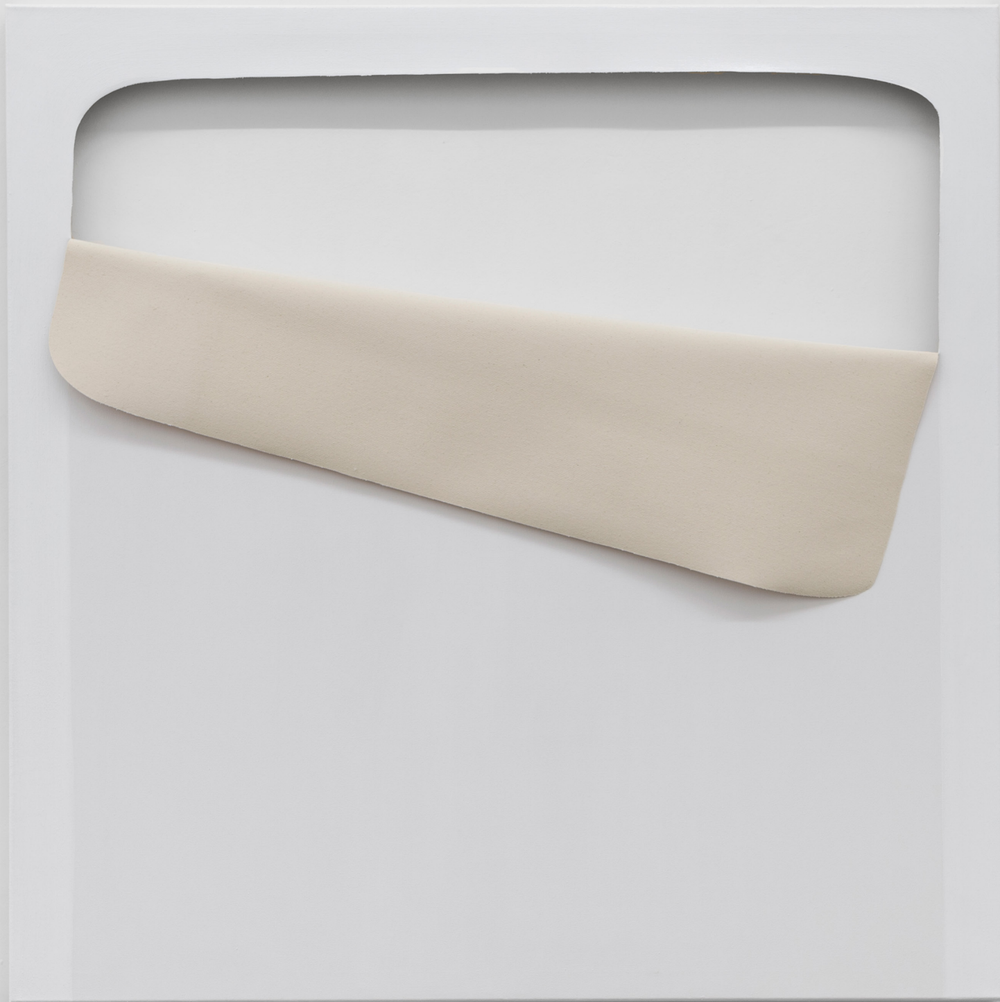
"Folded on Pink" 2017 Oil, Lacquer, on Canvas 135 x 135 cm