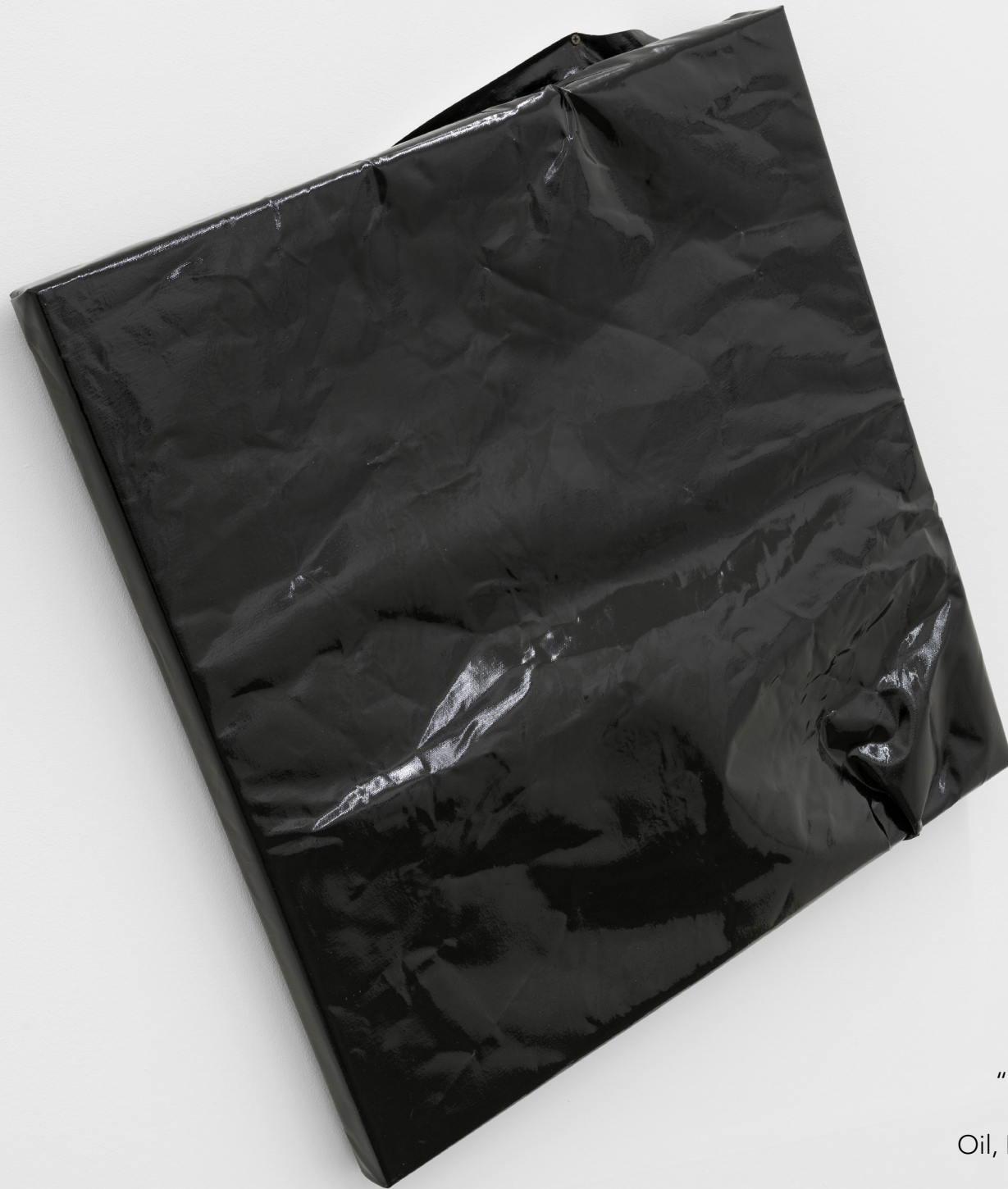
"Wringing Lilies from Acorns" 2017 Oil, Resin, Steel Screw on Canvas 70 x 70 cm (75 x 75 x 8 cm)