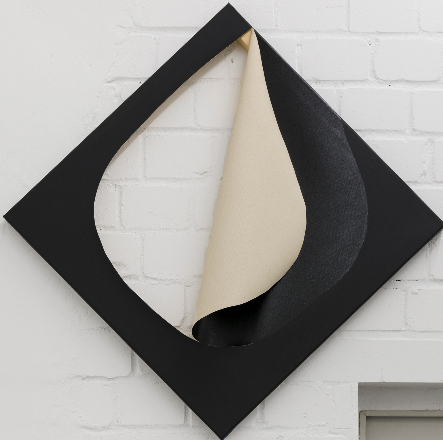
"In Itself" 2017 Oil, Resin on Canvas 70 x 70 cm (112 x 112 x 15 cm)