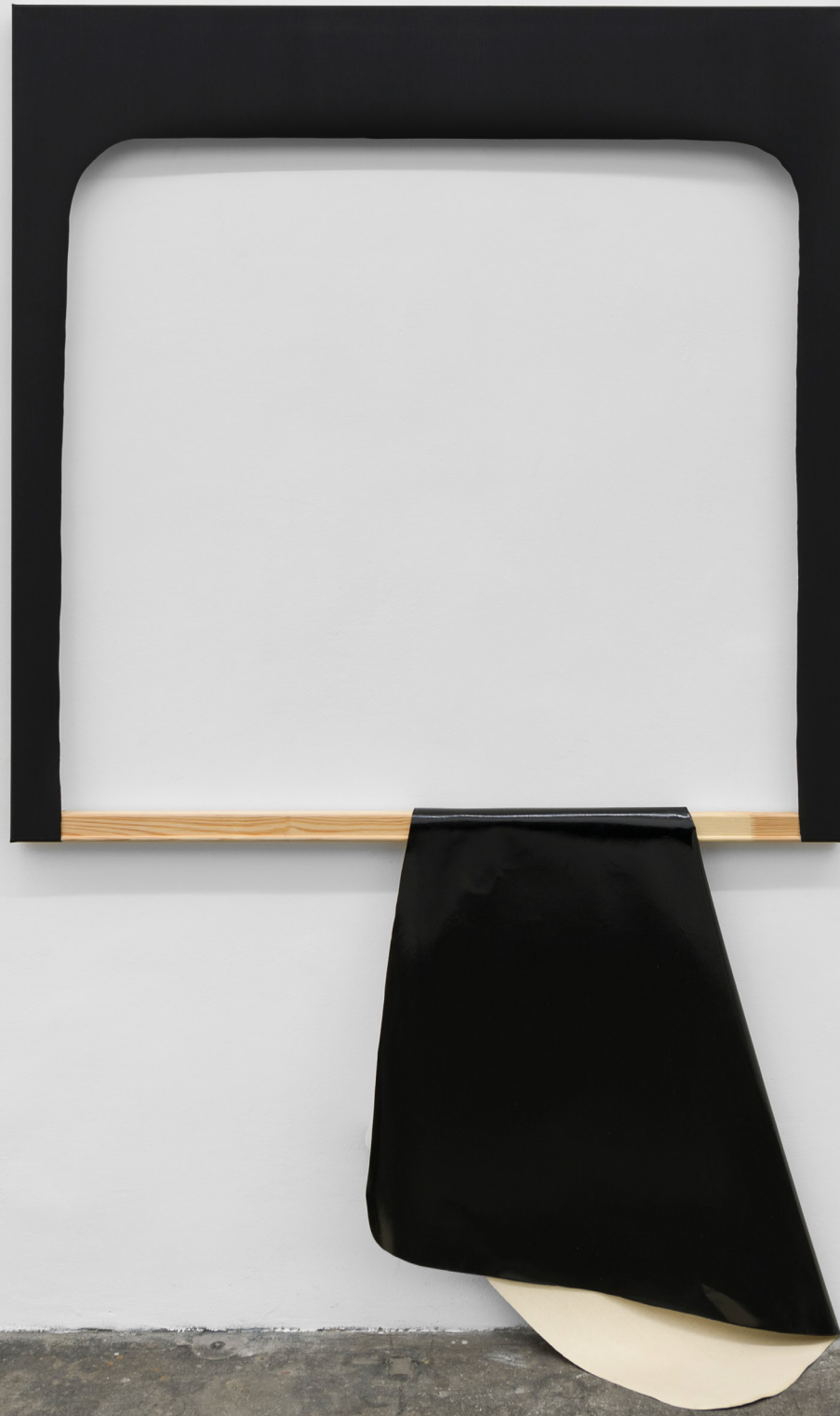
"Left to Dry" 2017 Oil, Resin, Wood on Canvas 135 x 200 cm (135 x 215 x 22 cm)