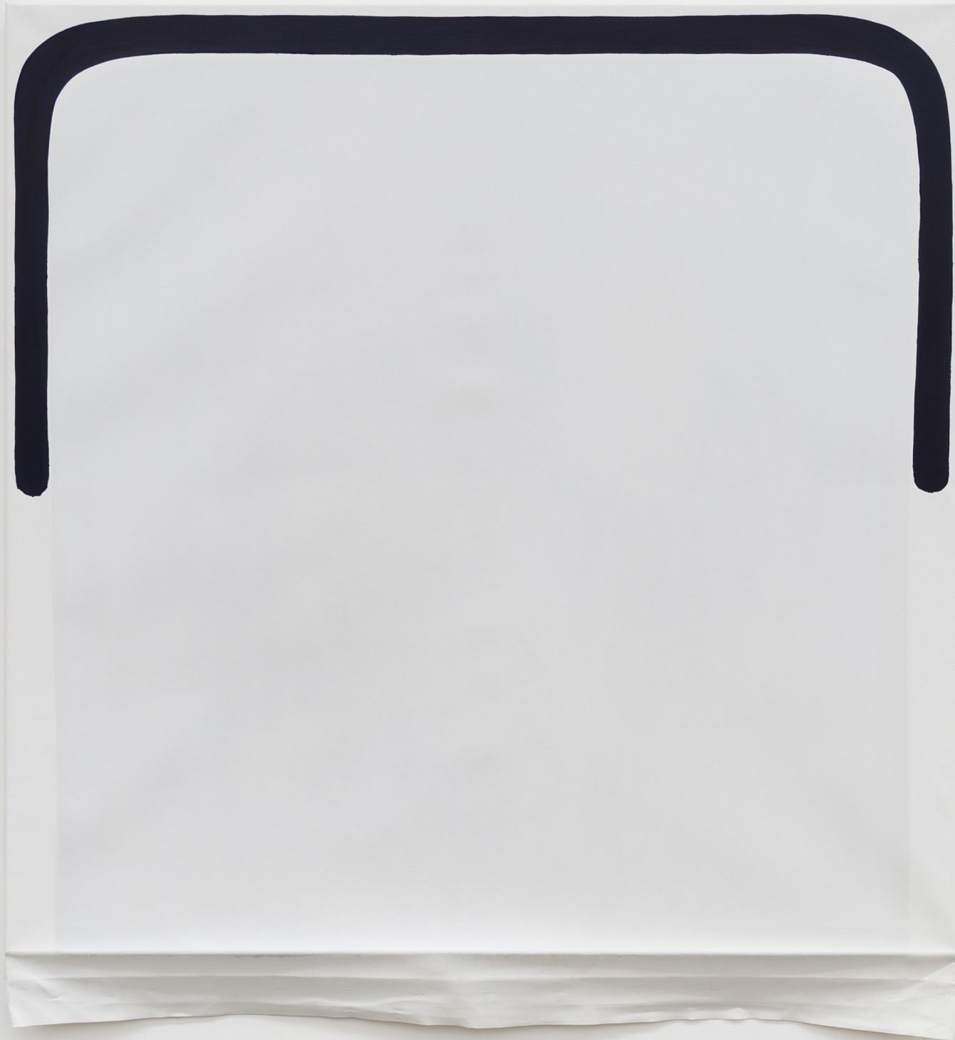
"You've Forgotten Something" 2017 Oil, Acrylic, on Canvase 135 x 145 cm