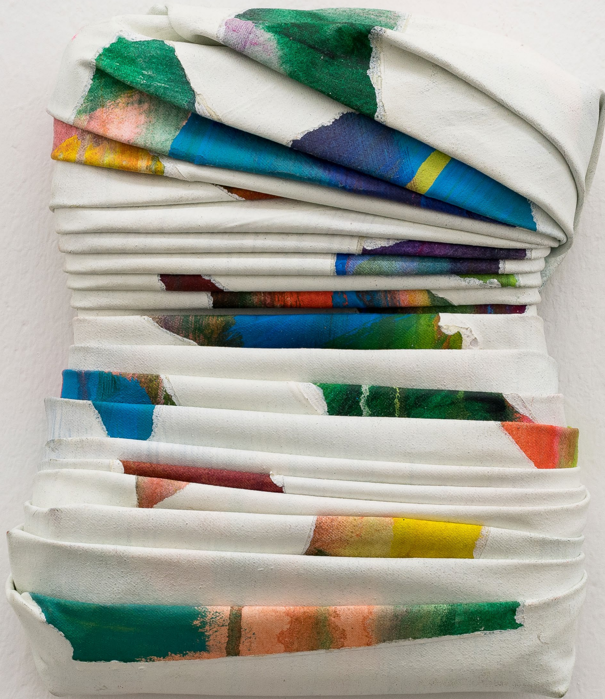
„gesimst nr. 6“ 2014 acrylic and ink on canvas 20 x 17 cm