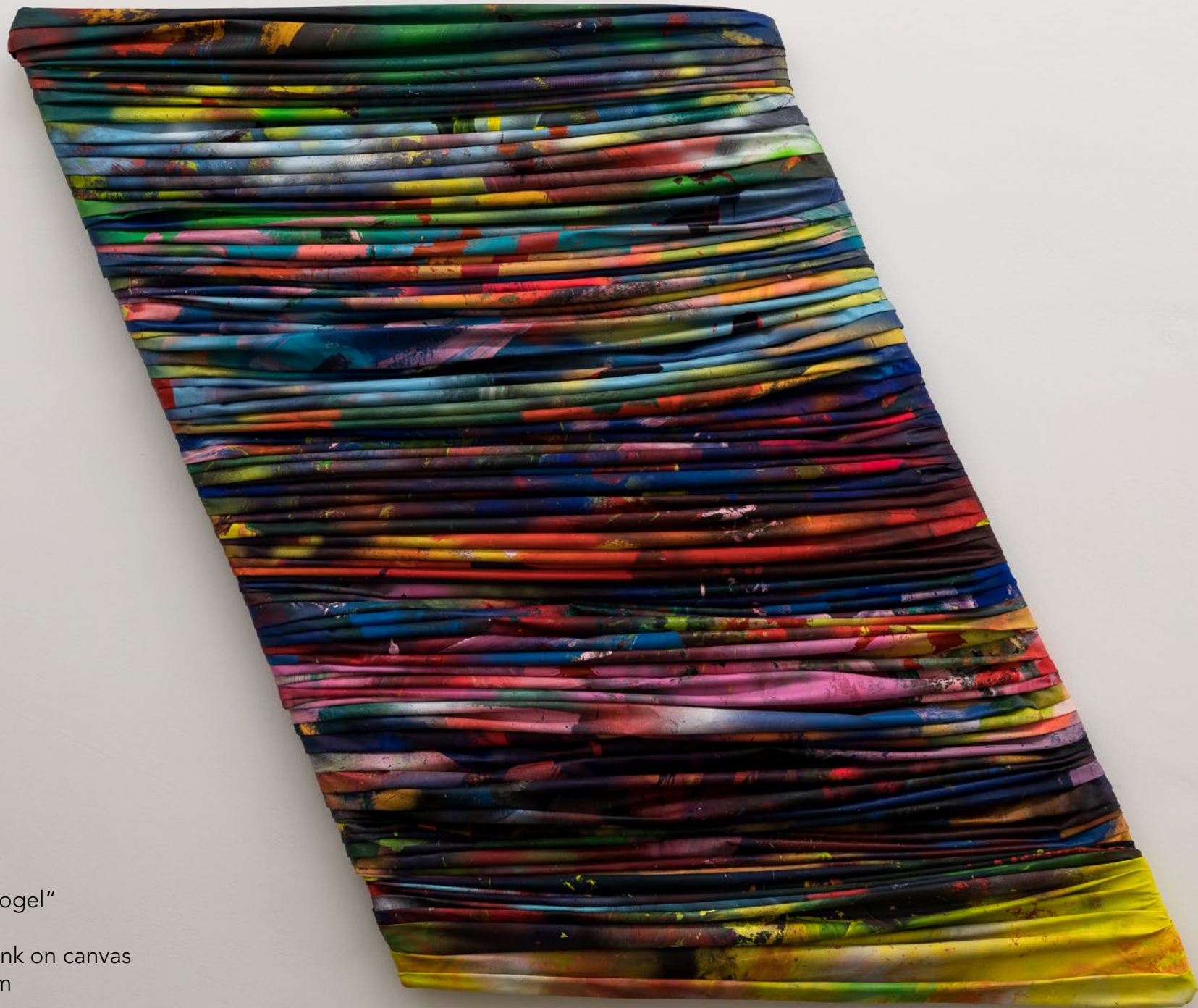
„schräger Vogel“ 2016 acrylic and ink on canvas 137 x 102 cm