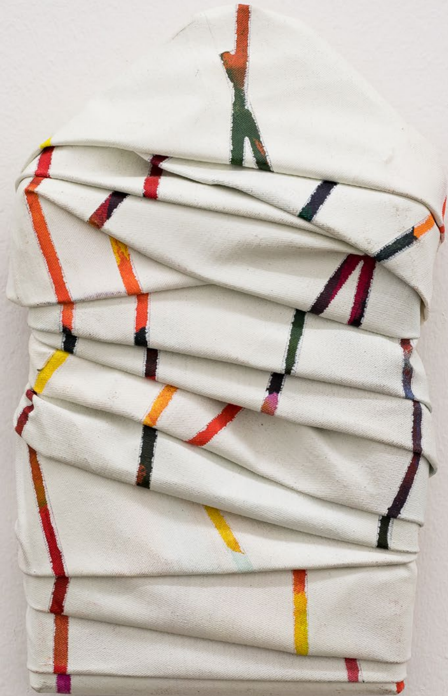
„gesimst nr. 10“ 2015 acrylic on canvas 25 x 14 cm