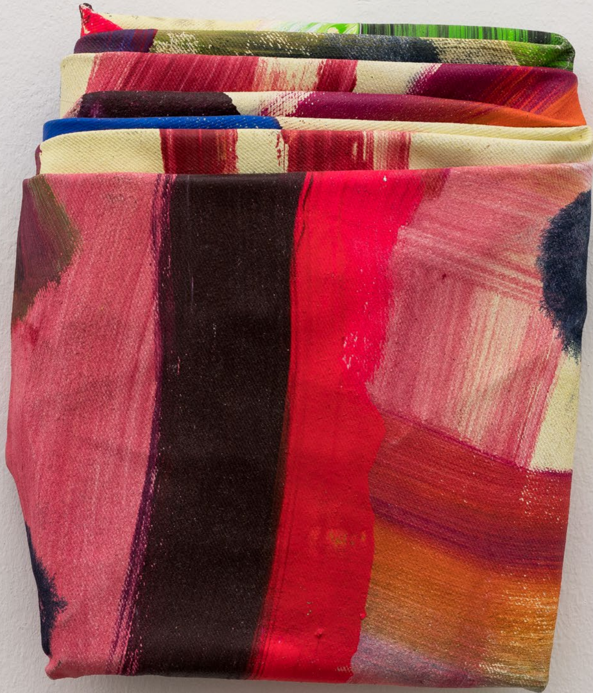
„gesimst nr. 8“ 2014 acrylic and ink on canvas 24 x 20 cm