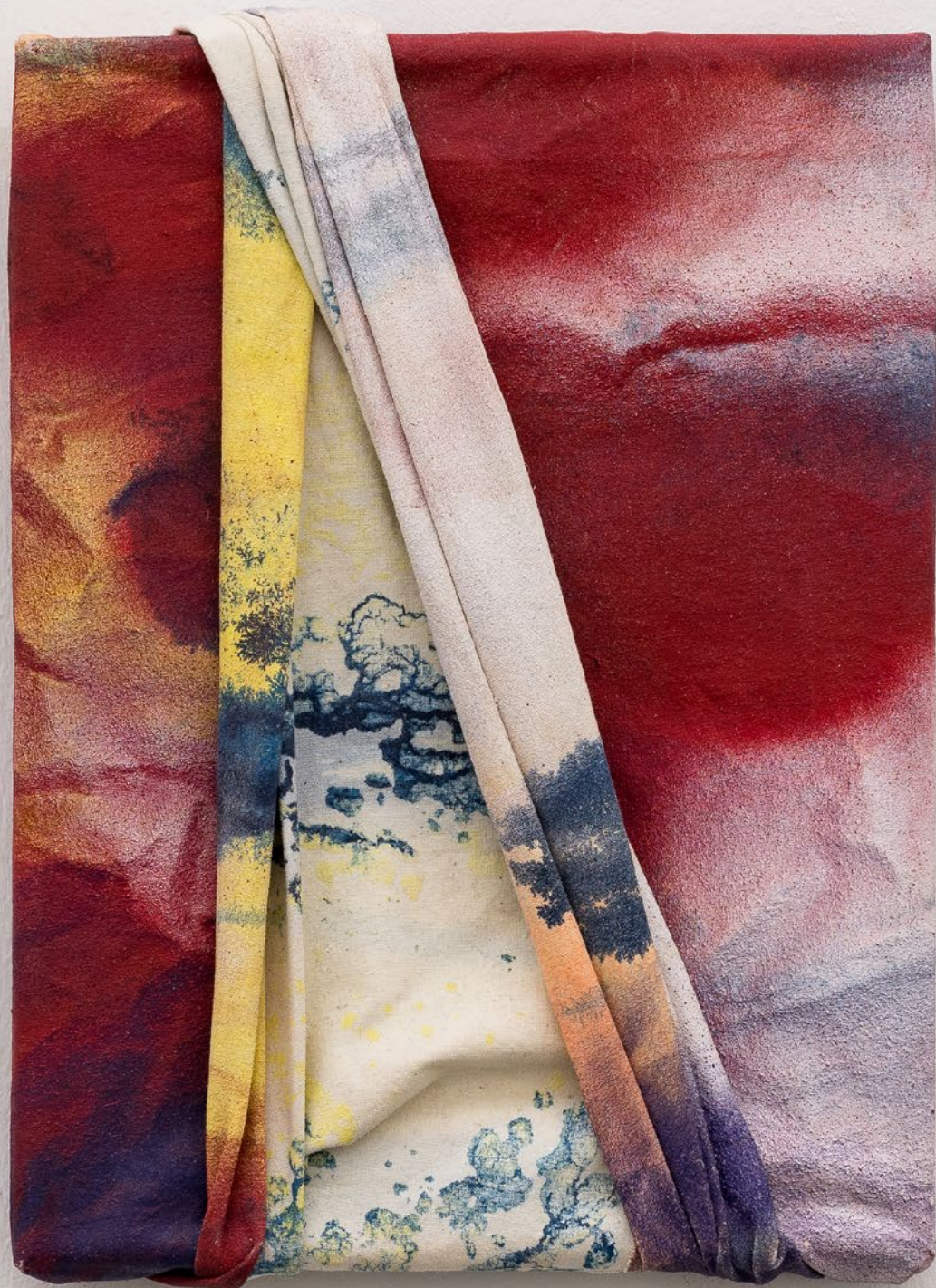
„gesimst nr. 2“ 2014 acrylic and ink on canvas 25 x 18 cm