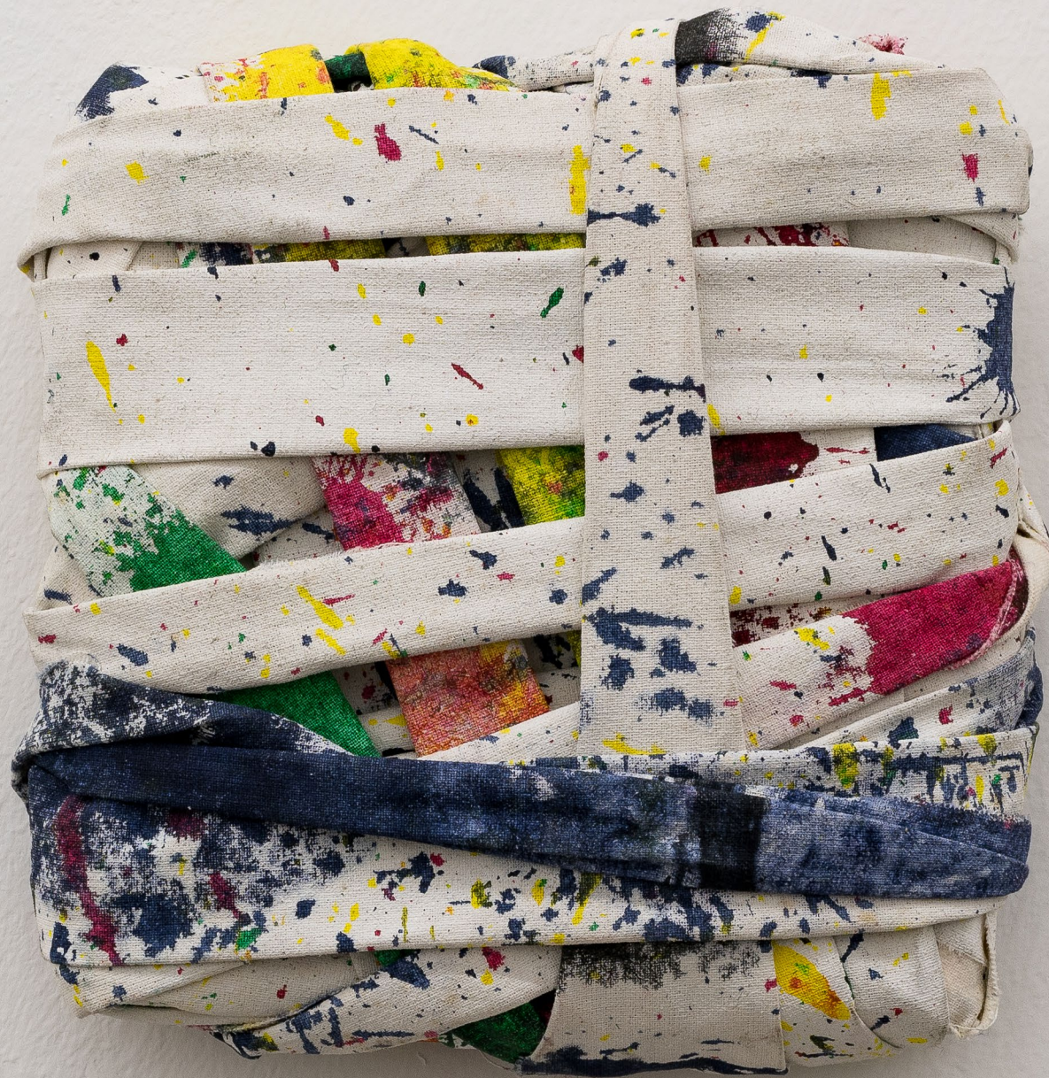
„gesimst nr. 9“ 2015 acrylic and ink on canvas 15 x 14 cm