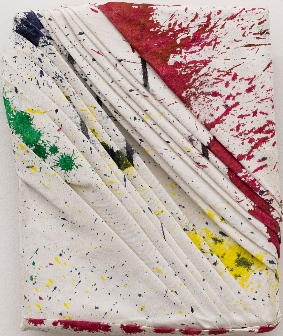
„gesimst nr. 3“ 2014 acrylic and ink on canvas, 31 x 25 cm