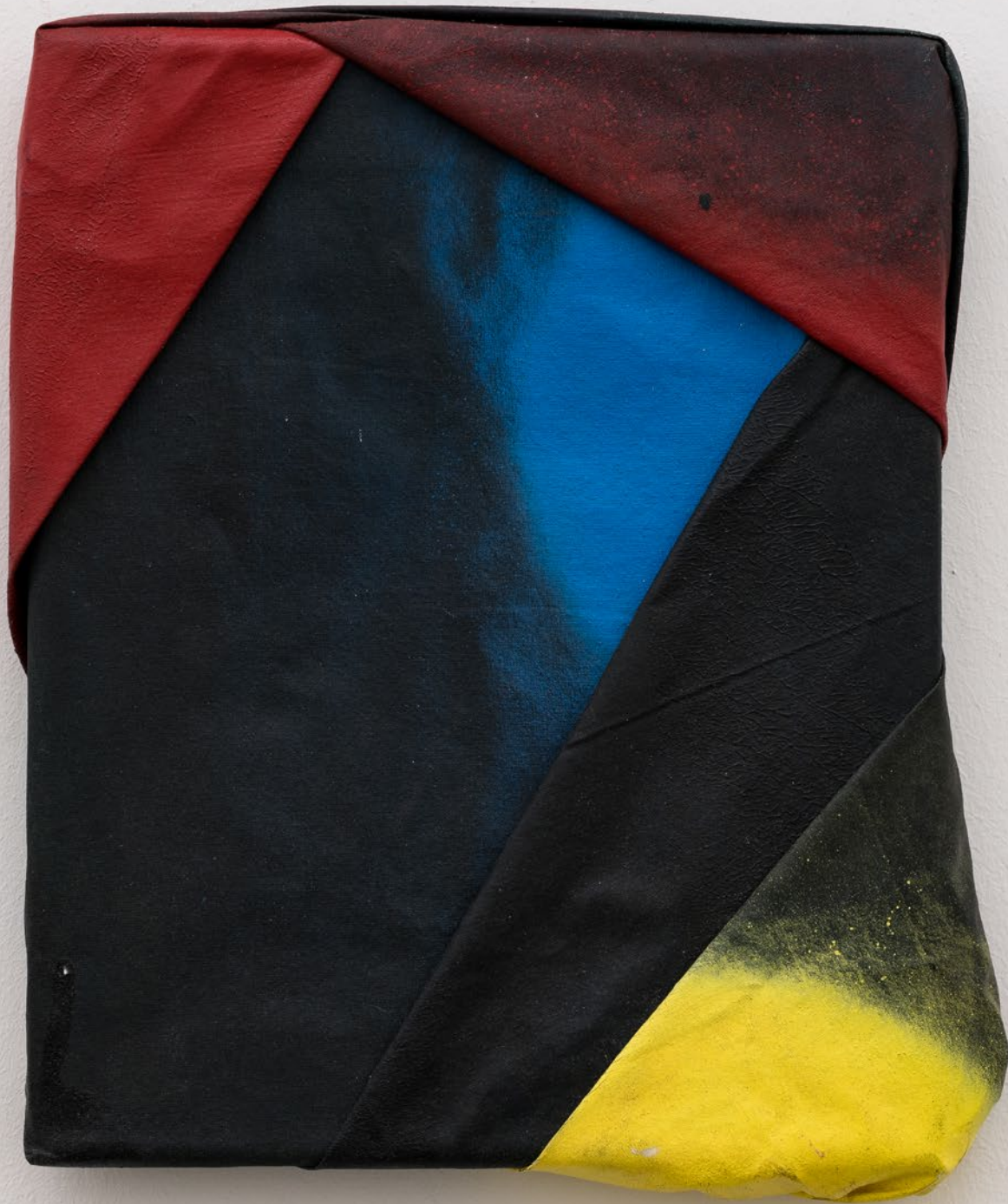
„gesimst nr. 4“ 2014 acrylic on canvas 31 x 27 cm