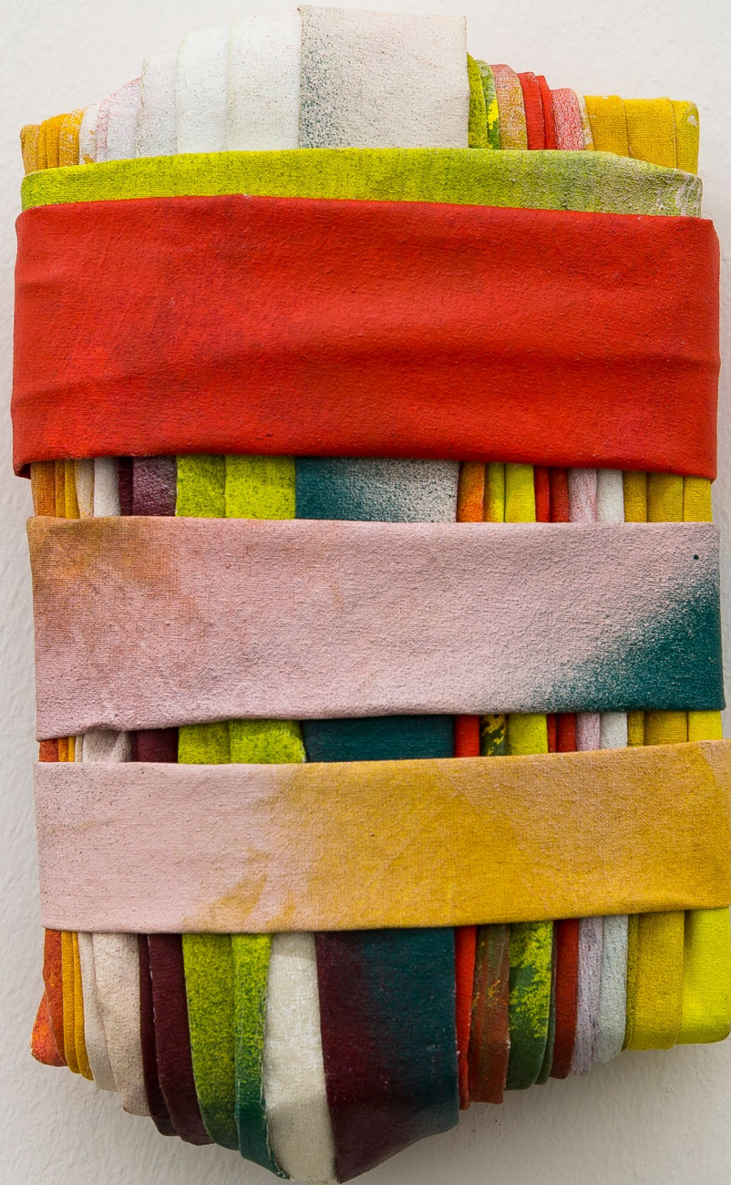
„gesimst nr. 5“ 2014 acrylic and ink on canvas 23 x 14 cm