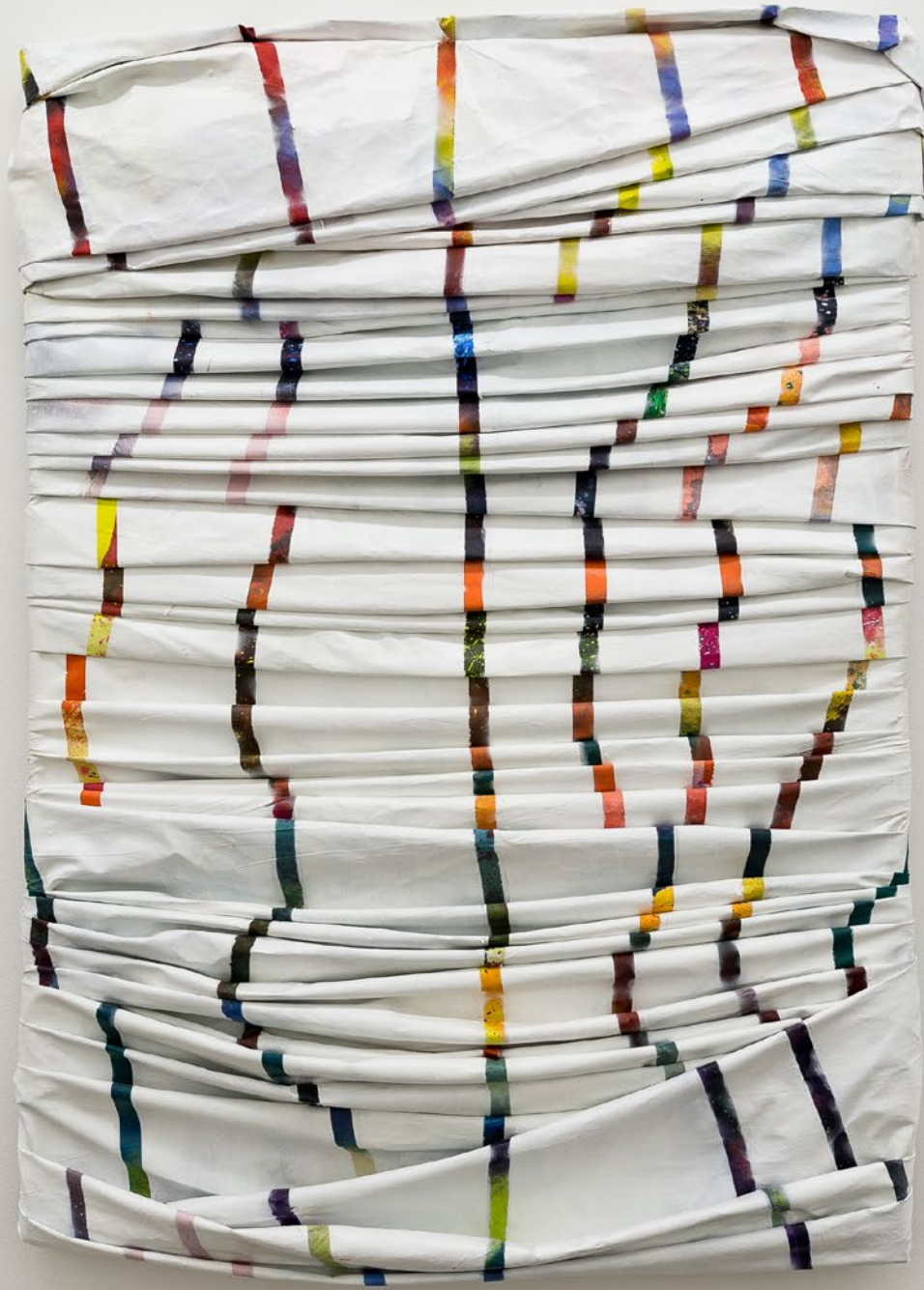
„grade genug“ 2015 acrylic and ink on canvas 115 x 83 cm