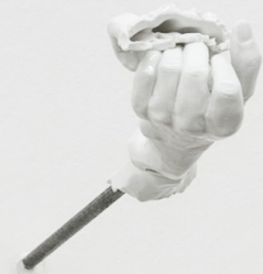
„Fought the beast“ 2017 porcelain, metal 76 x 9 x 6 cm