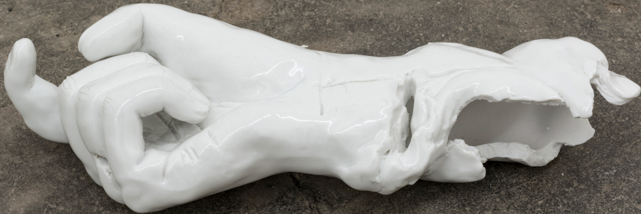
„Served the beast“ 2017 porcelain 21,5 x 7 x 5,5 cm