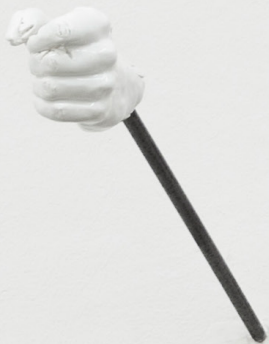
„Admired the beast“ 2017 porcelain, metal 64 x 9 x 8 cm