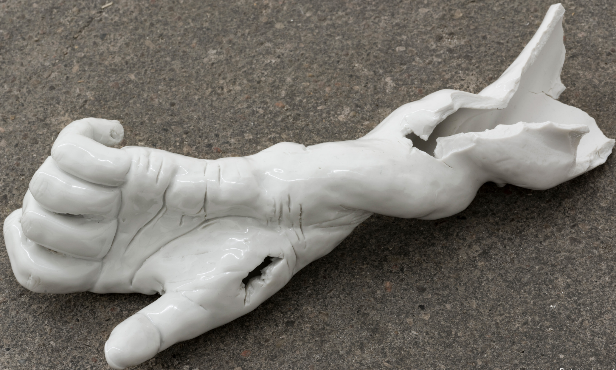
„Pet the beast“ 2017 porcelain 24 x 6,5 x 8,5 cm