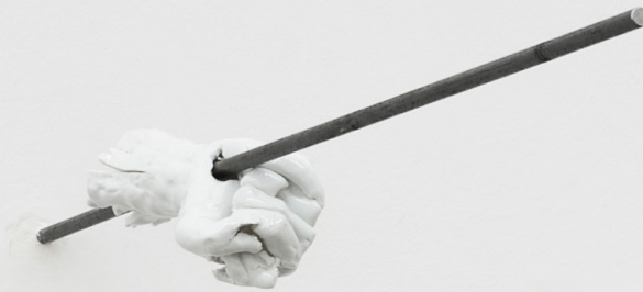
„Adored the beast“ 2017 porcelain, metal 54 x 7 x 5,5 cm