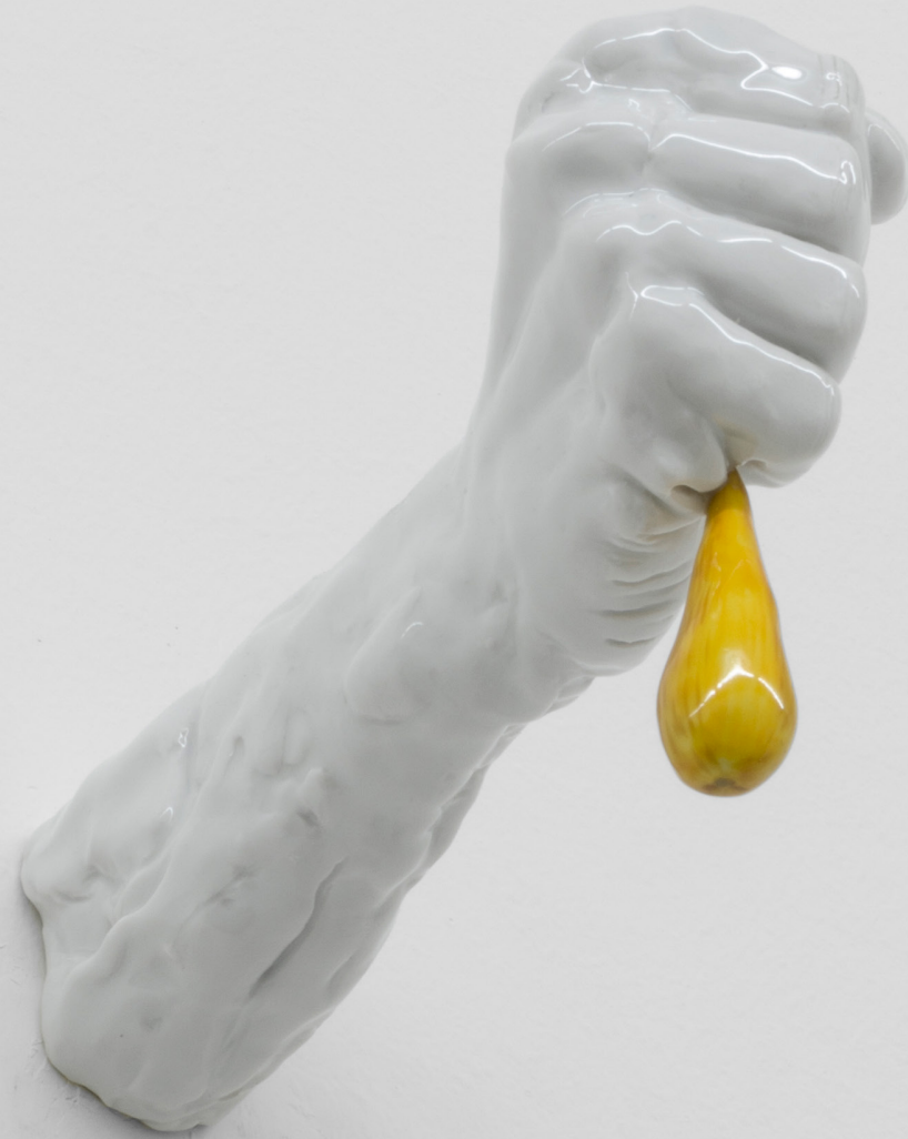
„Dreamed of the beast“ 2017 porcelain, handpainted, metal 18,5 x 13,5 x 6 cm