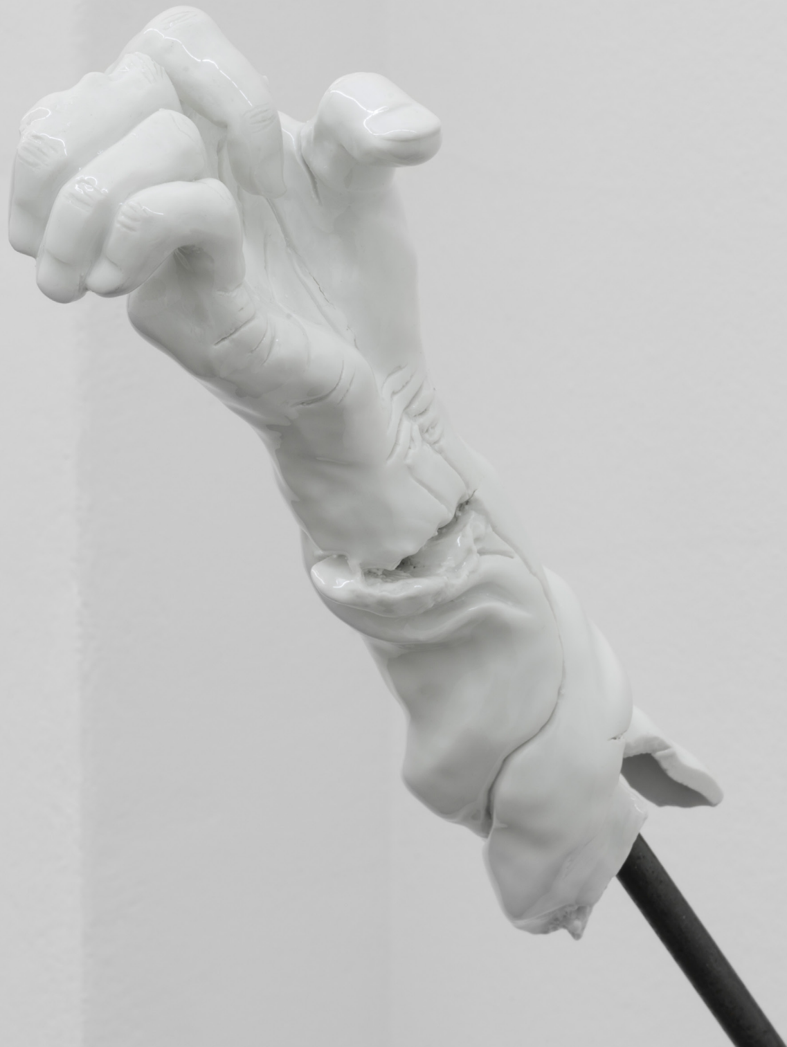
„Danced with the beast“ 2017 porcelain, metal 71 x 7,5 x 9 cm