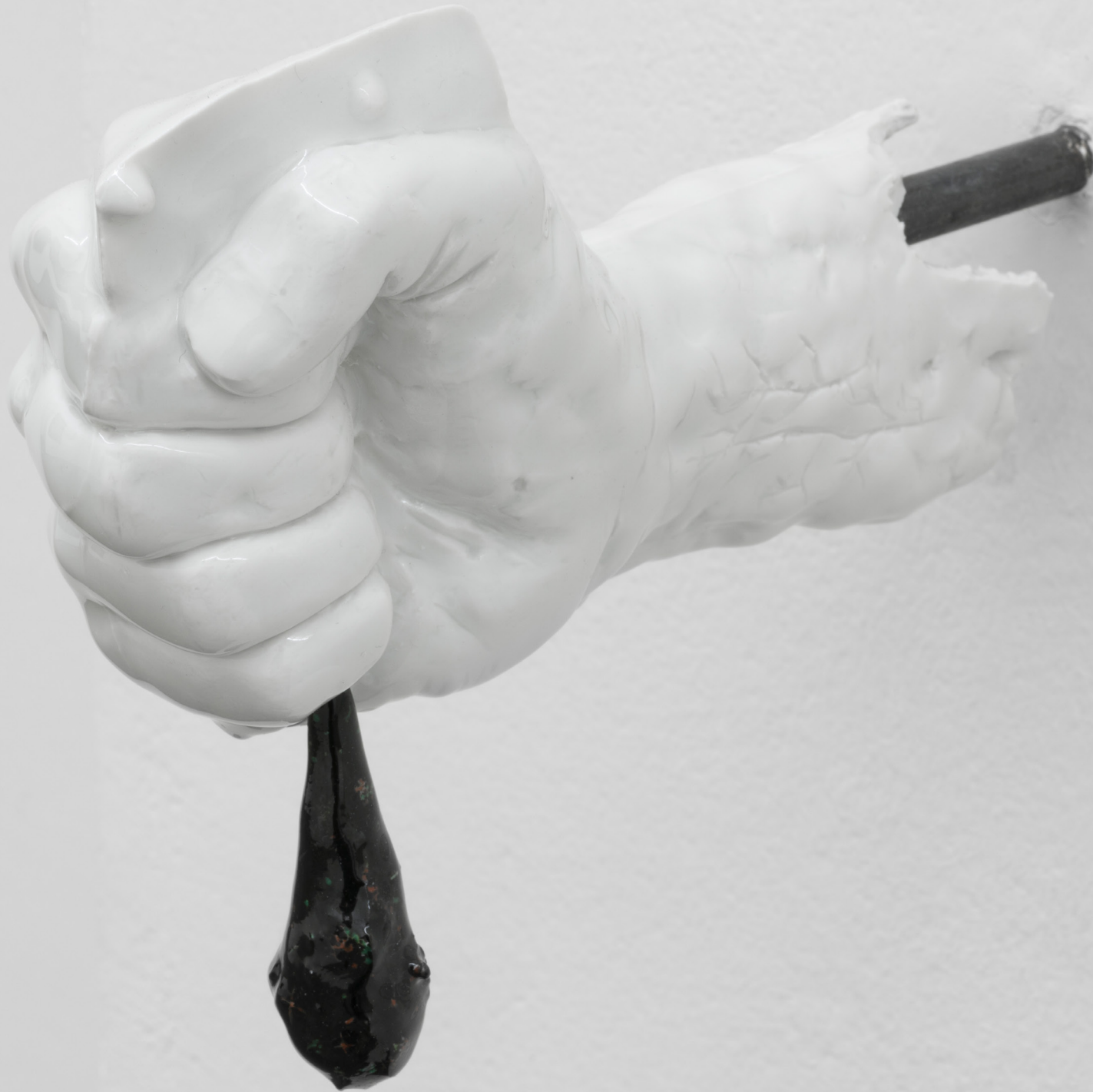
„Feared the beast“ 2017 porcelain, handpainted, metal 21 x 15 x 6 cm